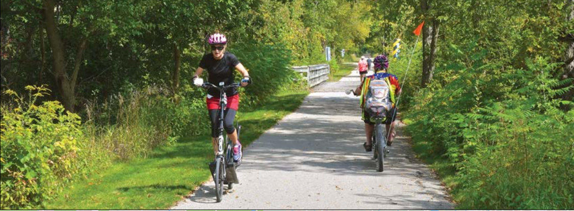
Trail is paved with asphalt from Pinckney to Whitmore Lake Road.

Mike Levine Lakelands Trail State Park • Huron River Water Trail